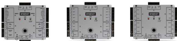
V100 Reader Module