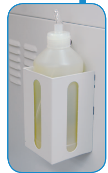
Optional EvenFlow™ Automatic Oiling System

Formax – New Hampshire, USA www.formax.com