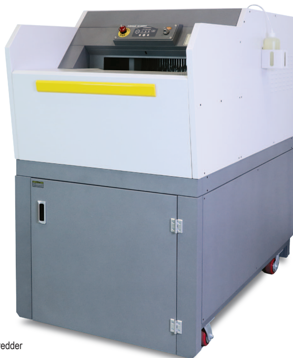
FD 8906CC Industrial Shredder