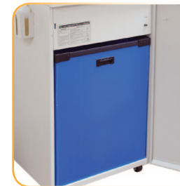
Heavy Duty Waste Bin