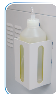
EvenFlow™ Automatic Internal Oiling System

*Capacity varies depending on paper and power supply