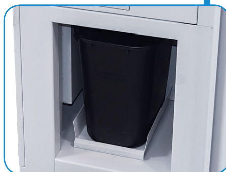
Rugged molded plastic waste bin for convenient storage and disposal