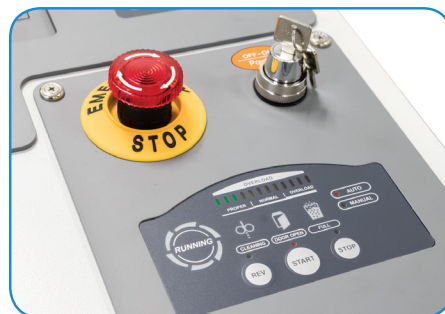
LED control panel, safety key lock and large emergency stop button