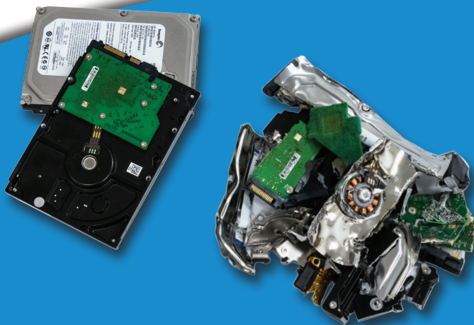
3.5" HDD Hard Drives Shredded with the FD 87HDS-R