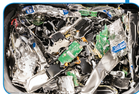
Particles fall into the waste bin for easy storage and disposal