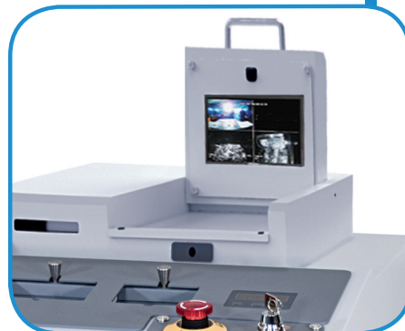
Recording System internal and external cameras to monitor input and output of drives for optimal security

Formax - New Hampshire, USA www.formax.com